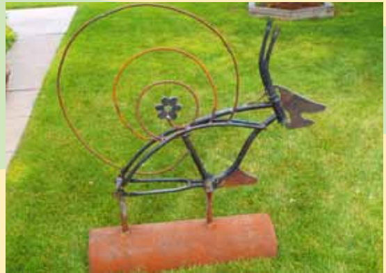
Decorative "bugs" made from junked-out bicycles by a local artist.