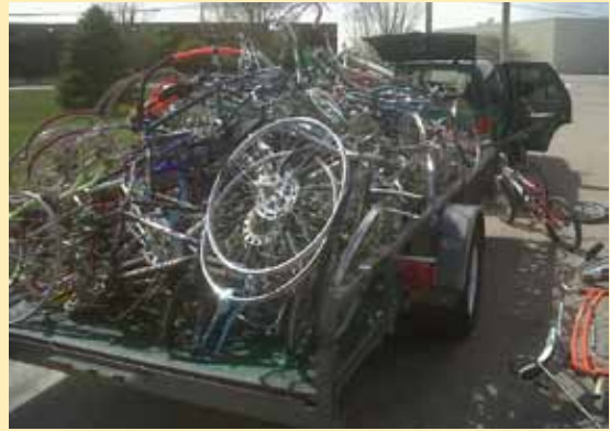
Recycle Your Cycles is an annual Scottsbluff/Gering event.