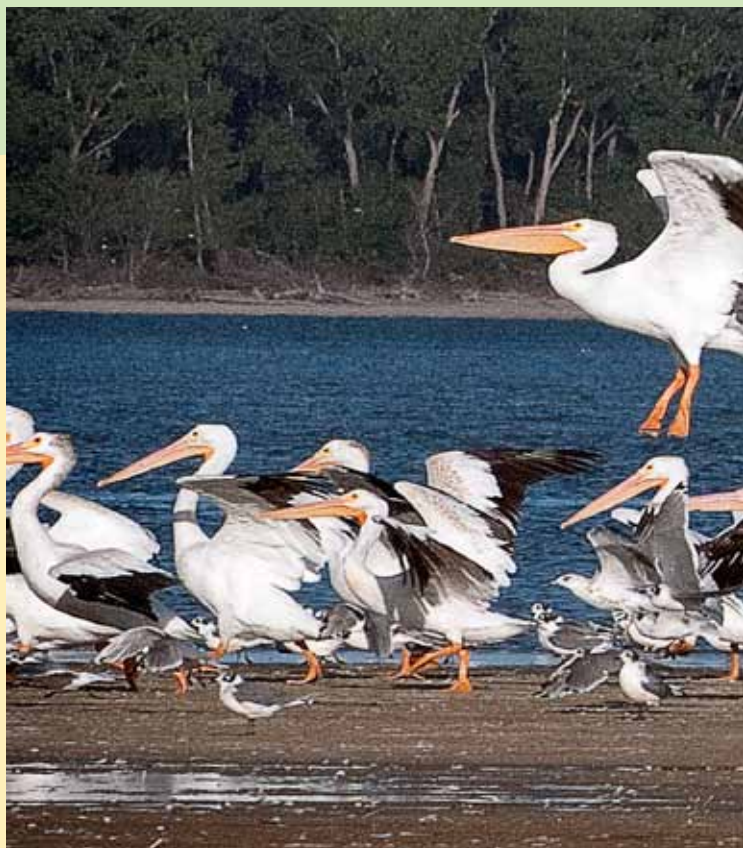
Pelicans at Sutherland Reservoir.