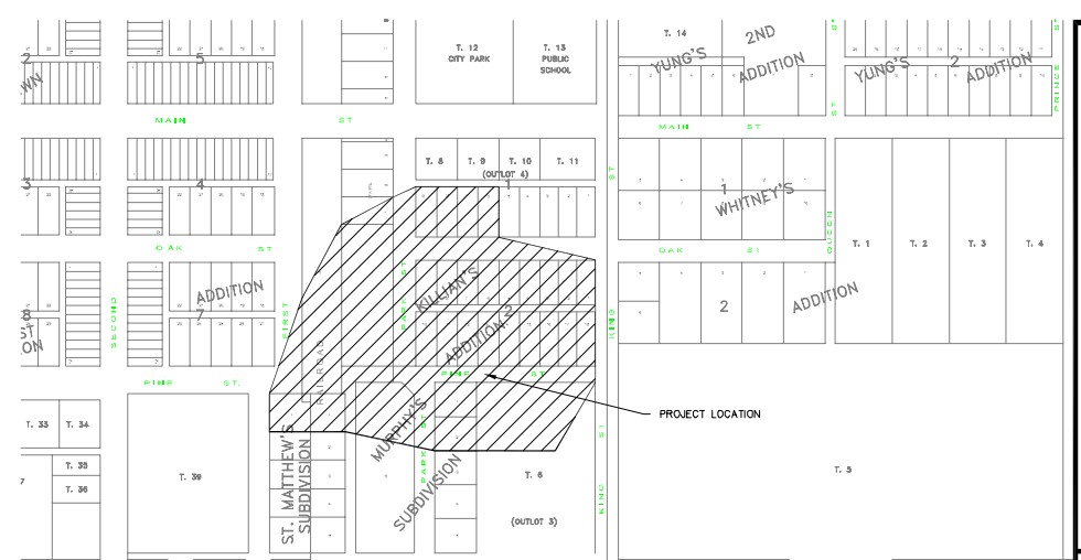
VICINITY SKETCH NO SCALE