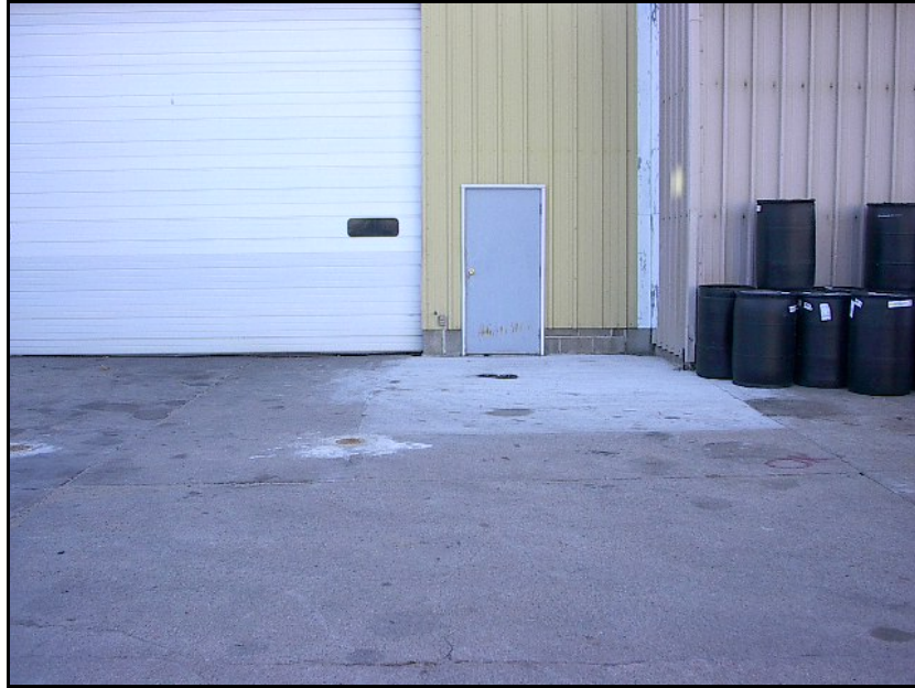
View of the source area and north side of the Pollard shop building.