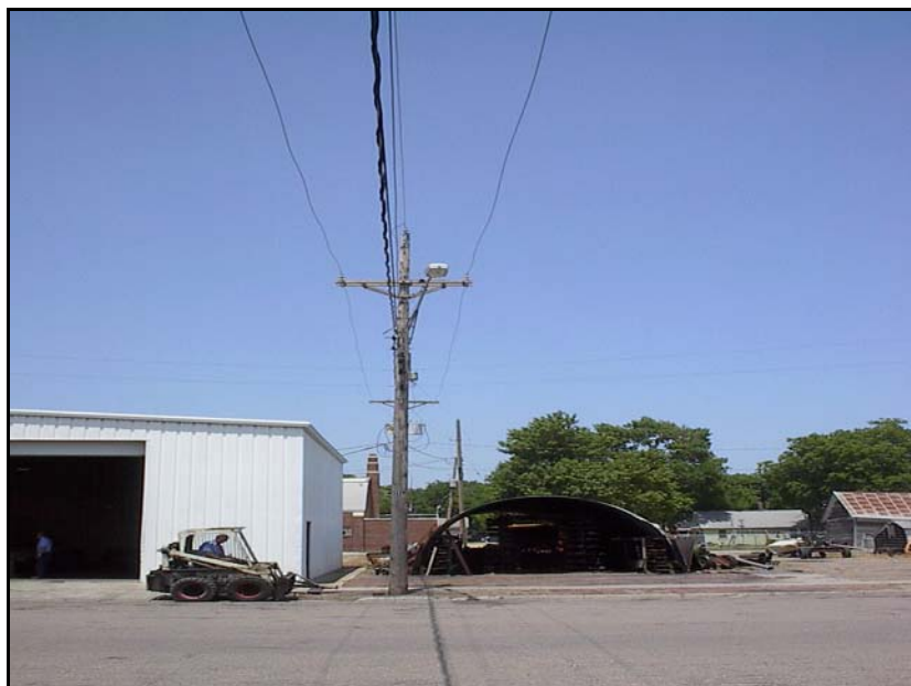
View of the power lines running above the source area.