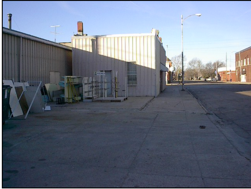
View of the Pollard Implement building looking southwest from the northeast corner of the property.