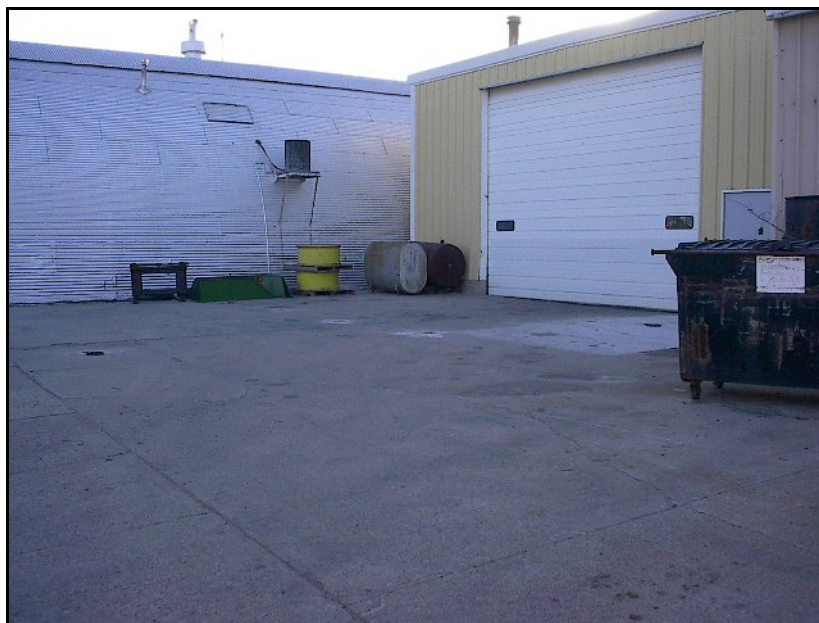
View of the storage area located east of the source area. Photo was taken facing southeast from recovery well RW-1.