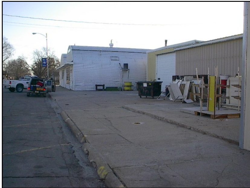
View of the source area and neighboring Kruger Feed & Seed building facing east from the northwest corner of the property.