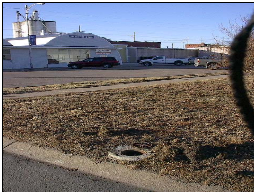
View of the subject property looking southwest from monitoring well MW-6P.