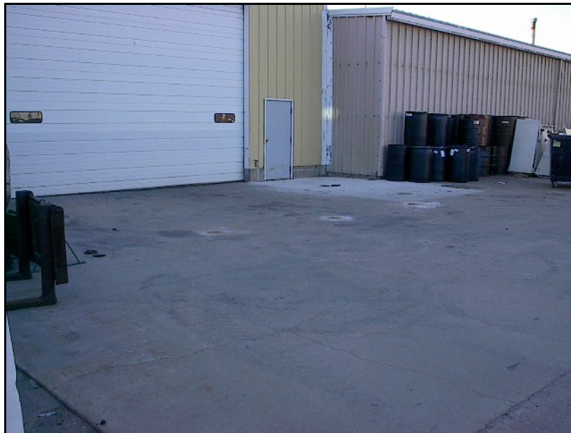
View of the source area looking southwest from the northeast corner of the property.