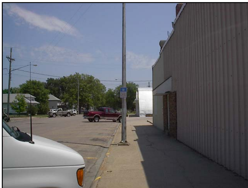
View facing east from the northwest corner of the subject property.