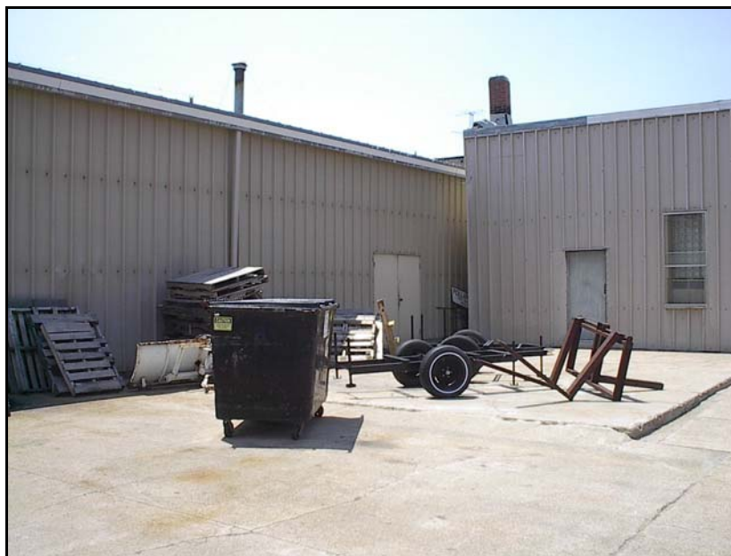
View of the storage area located west of the source area. Photo was taken looking southwest from East 7 th Street directly north of the source area.