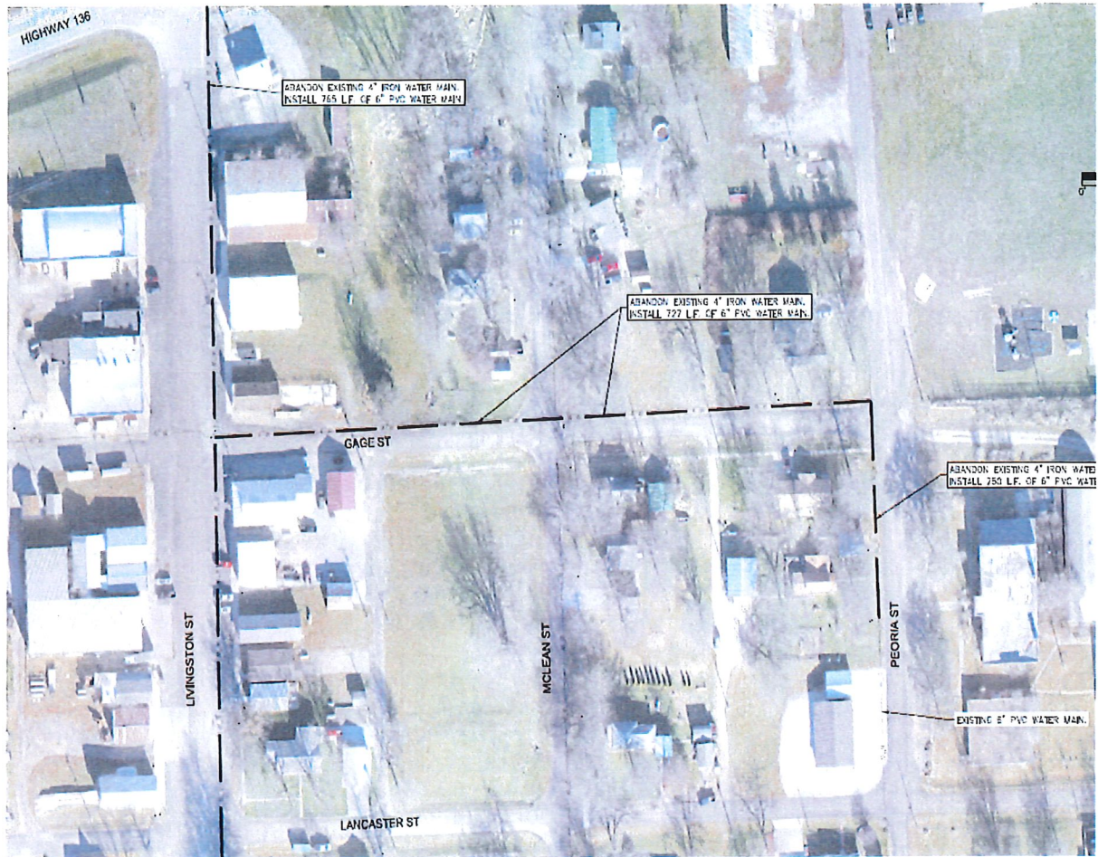
Figure 1: Water Main Replacement