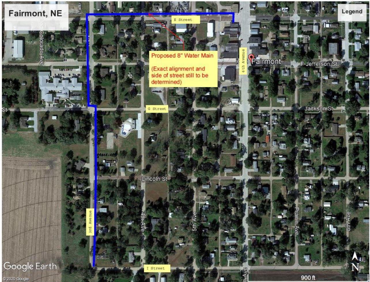
(From SRF Funding Pre-application submitted by JES Consulting Group, Inc., December 2020)