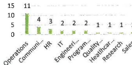
Figure 2. NDEE 2019 Social media followers by profession on the agency's LinkedIn account.