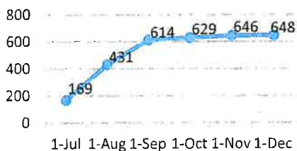
Figure 1. NDEE 2019 Social media followers on the agency's Facebook account.

Other key accomplishments of the Grow Nebraska Team included development and distribution of a Public Outreach and Program Participation Survey followed by the Agency's first formal outreach plan. As part of the Outreach Plan, the NDEE GNT worked across divisions within the agency to identify partnership agencies and organizations where we regularly engage and when (i.e. quarterly, bi-annually, etc.). This effort was in response to survey respondents' statements that said they try to go to events where NDEE staff is attending or presenting.